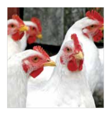
Egg Products Inspection Act Amendments H.R. 1731 / S. 820

Preservation of Antibiotics for Medical Treatment Act / Preventing Antibiotic Resistance Act H.R. 1150 / S. 1256