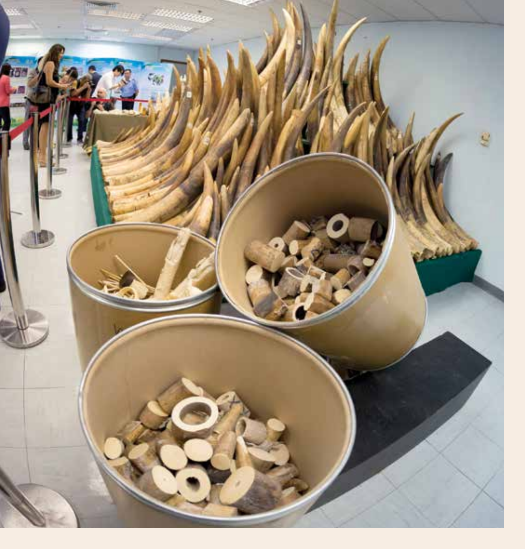
IT TAKES A WORLD

TWENTY-FIVE YEARS AFTER CITES BANNED THE INTERNATIONAL COMMERCIAL TRADE IN IVORY, MORE WORK REMAINS TO BE DONE FOR ELEPHANTS