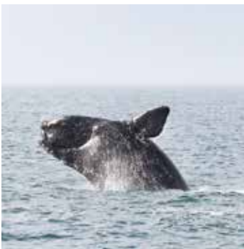
Rescuing Animals With Rewards (RAWR) Act H.R. 97 / S. 1590

To prohibit the possession of big cat species such as tigers and lions by individuals as pets or by poorly run animal exhibitors that allow public contact or photo-ops with these animals. Sponsors: Reps. Quigley, D-Ill.; Fitzpatrick, R-Pa. / Sen. Blumenthal, D-Conn. (Approved by House Natural Resources Committee in September.)