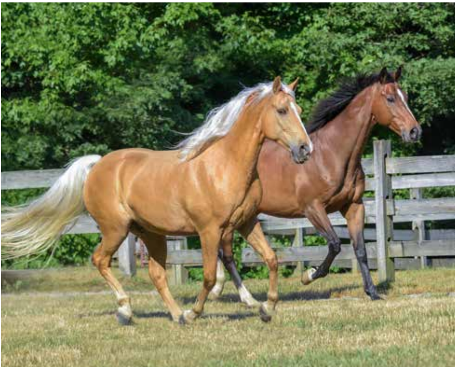
Congress passed the Horse Protection Act in 1970 to crack down on horse soring, but lax enforcement has allowed this cruelty to continue.

That rule, finalized and announced by the USDA in the last days of the Obama administration, would eliminate weaknesses in the agency’s Horse Protection Act (HPA) regulations that have allowed unscrupulous trainers to get away with animal cruelty. The rule would prohibit the use of devices integral to the soring process, eliminate the failed system of industry self-policing (which the USDA’s own inspector general found to be fraught with conflicts of interest) and put licensed professionals overseen by the agency in charge of inspections.