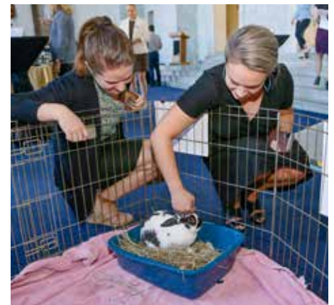
Congressional staffers learn about rabbit care and humane cosmetics while playing with adoptable rabbits at an event hosted by Rep. Tony Cárdenas and HSLF (see p. 8).