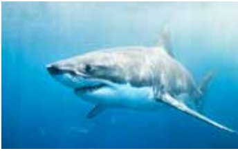
Shark Fin Trade Elimination Act H.R. 737 / S. 877

To prohibit possession, sale or purchase of shark fins or any product containing shark fins, and to establish penalties for violations. Sponsors: Reps. Sablan, D-N. Marianas; McCaul, R-Texas / Sens. Booker, D-N.J.; Capito, R-W.Va. (Approved by Senate Commerce, Science and Transportation Committee in April. Approved by House Natural Resources Committee in September.)