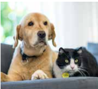
Preventing Animal Cruelty and Torture (PACT) Act H.R. 724 / S. 479

To prohibit extreme acts of animal cruelty when they occur on federal property or in interstate or foreign commerce. Sponsors: Reps. Deutch, D-Fla.; Buchanan, R-Fla. / Sens. Toomey, R-Pa.; Blumenthal, D-Conn. (Passed the House by a voice vote in October.)