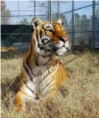
Conserving Ecosystems by Ceasing the Importation of Large Animal Trophies (CECIL) Act H.R. 2245

To prohibit possession, sale or purchase of shark fins or any product containing shark fins, and to establish penalties for violations. Sponsors: Reps. Sablan, D-N. Marianas; McCaul, R-Texas / Sens. Booker, D-N.J.; Capito, R-W.Va. (Approved by Senate Commerce, Science and Transportation Committee in April. Approved by House Natural Resources Committee in September.)