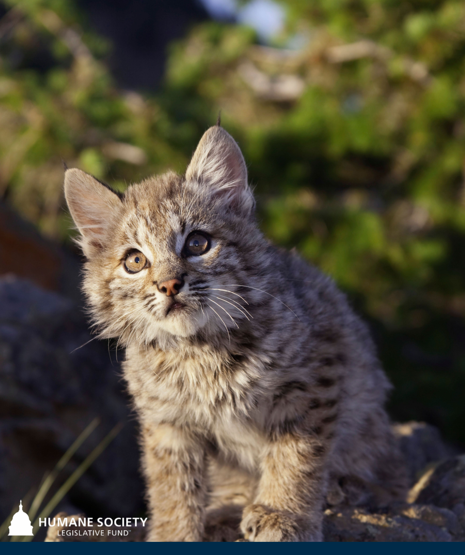
2024 Indiana Humane Scorecard